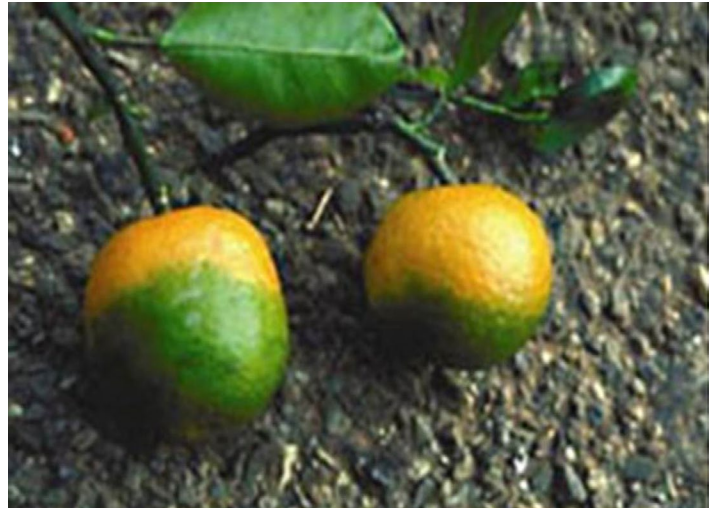
Citrus Greening

The purpose of this article is to examine the impact of the presence of citrus greening on new tree plantings in the Florida citrus industry. Sweet oranges are by far the most important citrus variety grown in Florida, so the analysis is limited to sweet orange plantings. Because citrus greening impacts citrus producers through reduced yield, increased mortality, and increased cost of production, it is expected