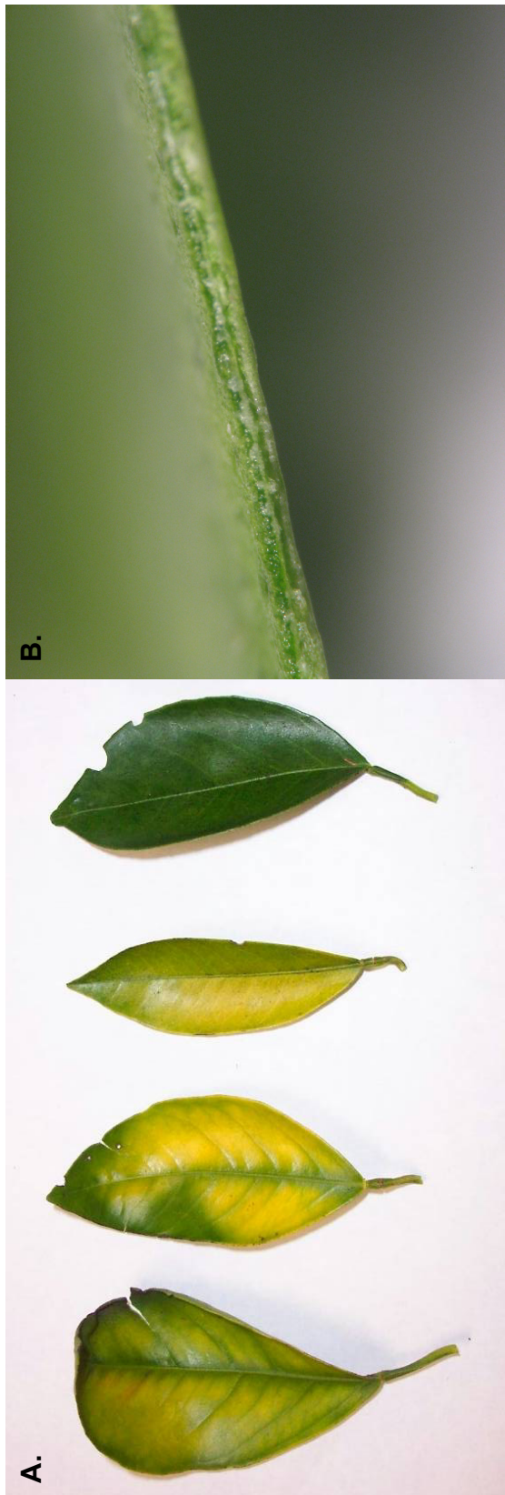
Figure 5. Leaves showing various yellowing symptoms, not typical of HLB, probably due to nutrient deficiency (A) do not stain darkly when immersed in iodine solution (B), indicating that these would not be good samples to submit for PCR analysis.