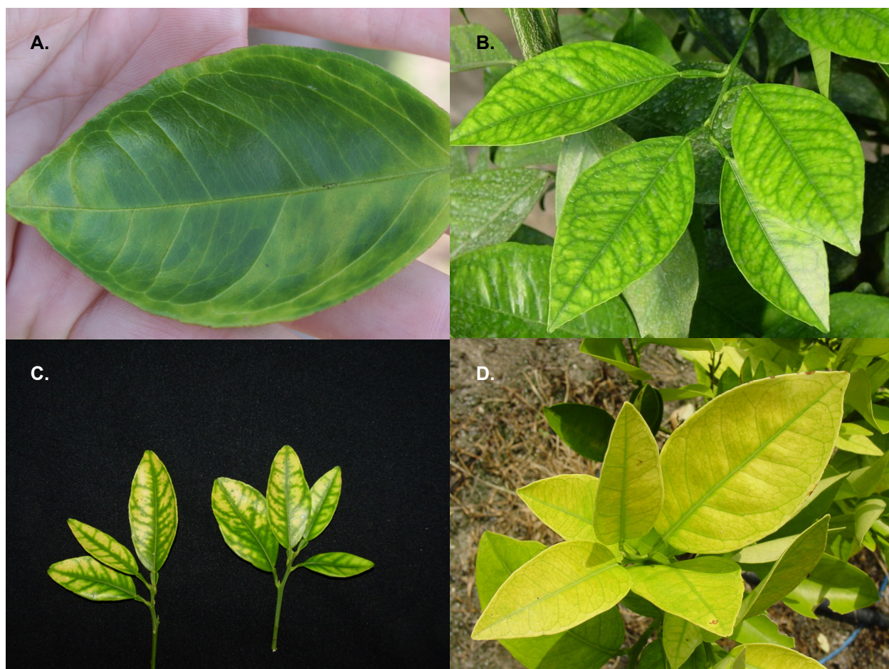
Figure 1. Citrus leaves showing HLB symptoms (A), manganese (B), zinc (C) and iron (D) deficiency symptoms.