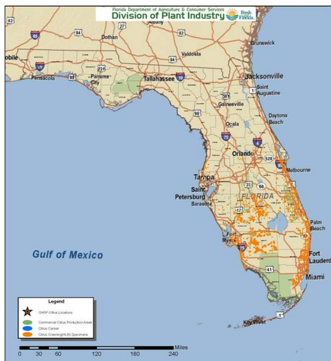
Figure 2. Known distribution of citrus greening (HLB) in Florida.