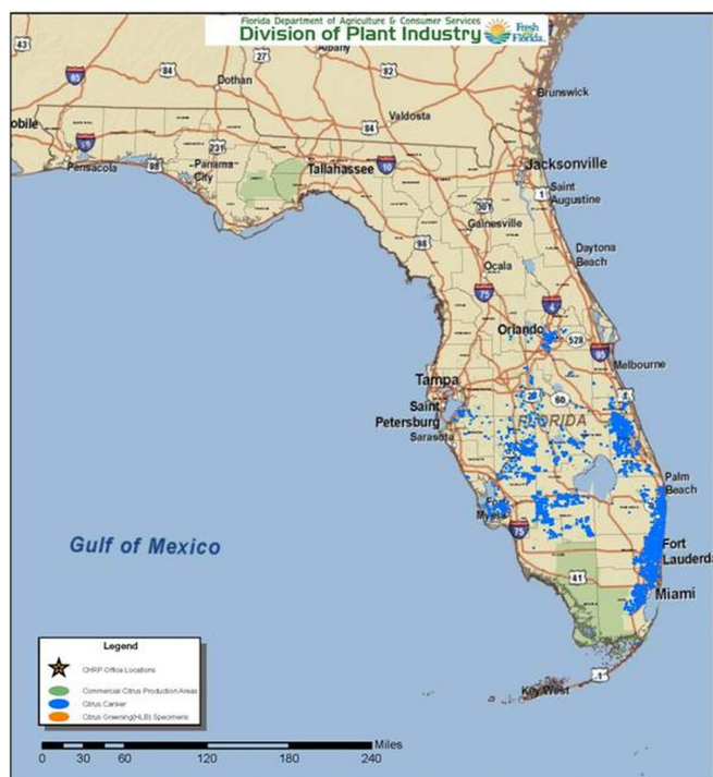
Figure 3. Known distribution of citrus canker in Florida.