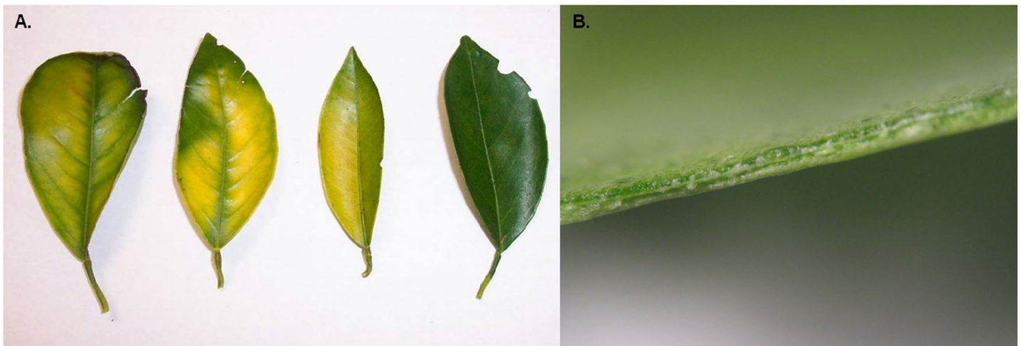
Figure 5. Leaves showing various yellowing symptoms, not typical of HLB, probably due to nutrient deficiency.