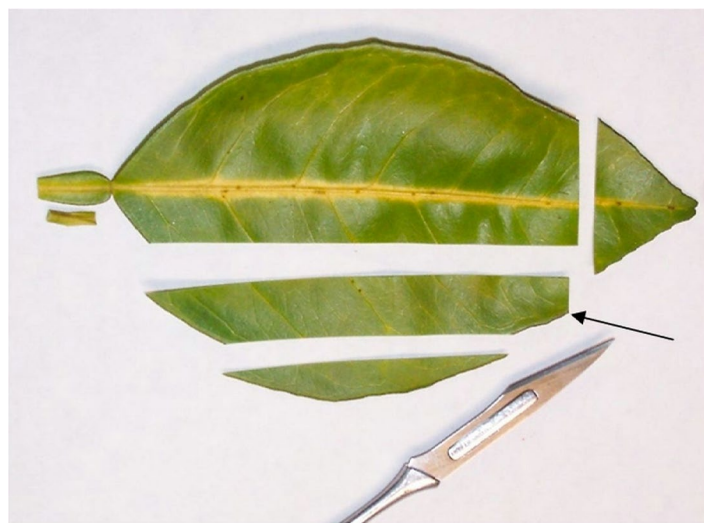
Figure 2. A citrus leaf with the vein corking symptom of HLB properly sectioned for the iodine test. The arrow indicates the symptomatic section to be used for testing.