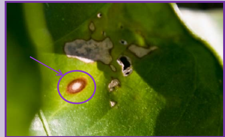
Leaf symptoms on Valencia

4) Early Virulent Spot (freckle spot) – small reddish irregularly shaped lesions. Occurs on mature fruit as well as post harvest in storage. Can develop into either virulent spot or hard spot. Virulent spot is caused by the expansion and/or fusion of other lesions covering most of the fruit surface toward the end of the season.