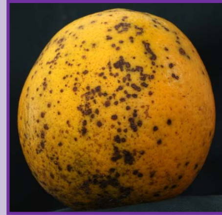
Small lesions that will likely develop into hard spot