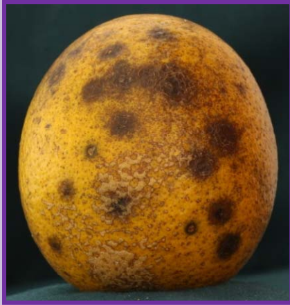
Cracked spot symptoms on Valencia