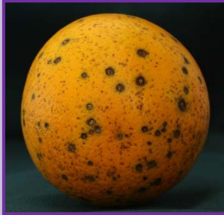
Hard spot symptoms on Valencia