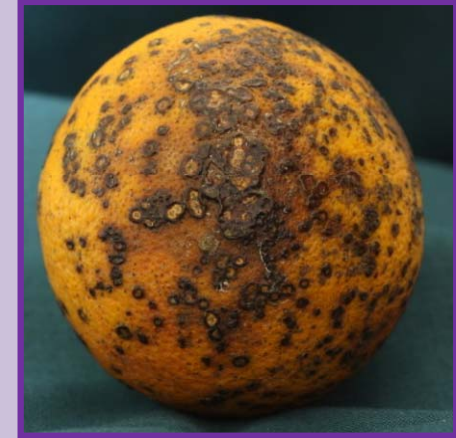
Severe hard spot symptoms on Valencia

Fungal Disease: caused by Guignardia citricarpa (sexual stage) / Phyllosticta citricarpa (asexual stage)