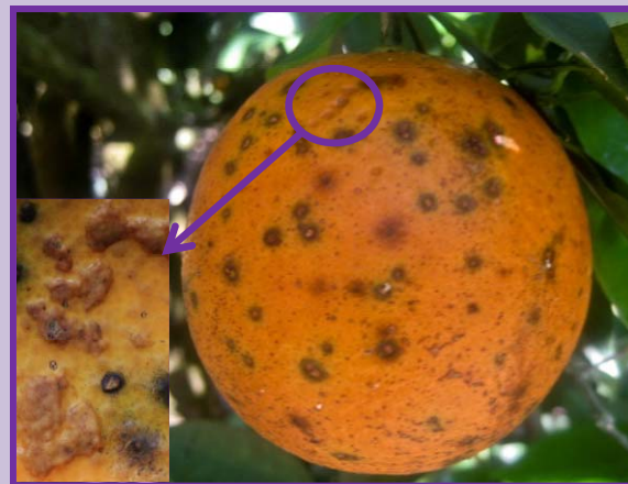
Early virulent (circled, inset) and hard-spot lesions with a close up of virulent spots