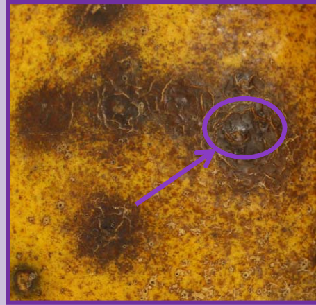
Close view of cracked spot with hard spots forming