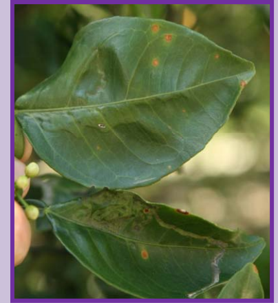
Young lesions on Valencia leaves