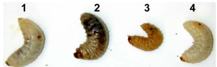
Figure 3. Larvae of the Diaprepes root weevil, 24 h post inoculation with homogenate from a iridescent virus-6 (IIV6) infected larvae, showing the range of pathogenicity. 1. Control larvae injected with water. 2. Larvae darkening, blackish color usually dies 3 - 4 d post inoculation. 3. Larvae yellowish color, usually dies 5 - 7 d post inoculation. 4. Larvae normal coloration, covertly infected, no visible symptoms.

Modes of transmission and persistence of iridovirus in nature are still being discovered (Williams, 1998). In this study, virus transmission between caged D. abbreviatus may occur through contamination of surfaces, contact during mating, or through the spiracles as an aerosol. Sexual transmission from males to females may be expected based on the observations by Marina et al. (1999) which reported sexual transmission of iridovirus in mosquitoes. Transmission of virus during sex may be accomplished during the transfer and absorption of proteins by females during mating (Harari et al. , 1999; Wolfner, 1997). Results show that infected females produced infected eggs, showing IIV6 can be vertically transmitted to the eggs. Vertical transmission has also been reported for iridoviruses in mosquitoes (Woodward and Chapman, 1968) and insect tissues found to be infected included ovaries, as well as the