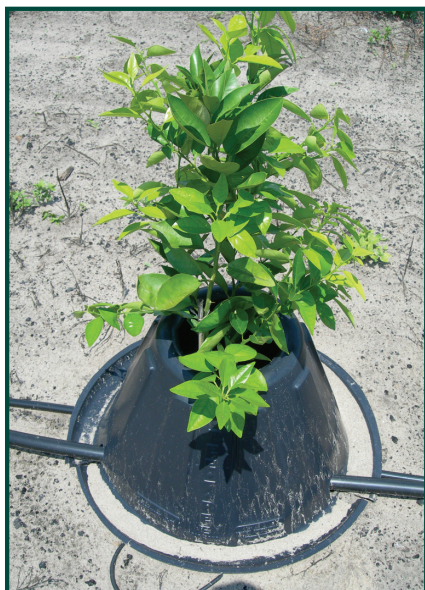
Figure 2. Young Hamlin trees after nine weeks of intensive drip fertigation.

and the soil moisture sensor readings. Horizontal capillary movement of water in the soil was approximately six inches, so the wetted patterns from two drippers 15 inches apart should completely intercept the root system of the young trees, shown in Figure 1. During the dry weather in May, daily water requirements per tree were 0.50 gallons for the drip method and 0.65 gallons for the microsprinkler method. Without the tree guard, daily irrigation requirements for the microsprinkler method would be about 8.6 gallons because a larger ground area would be wetted. Irrigation water savings due to the tree guards were also noticed in the conventional grower-scheduled treatment, and were estimated to be 93 percent.