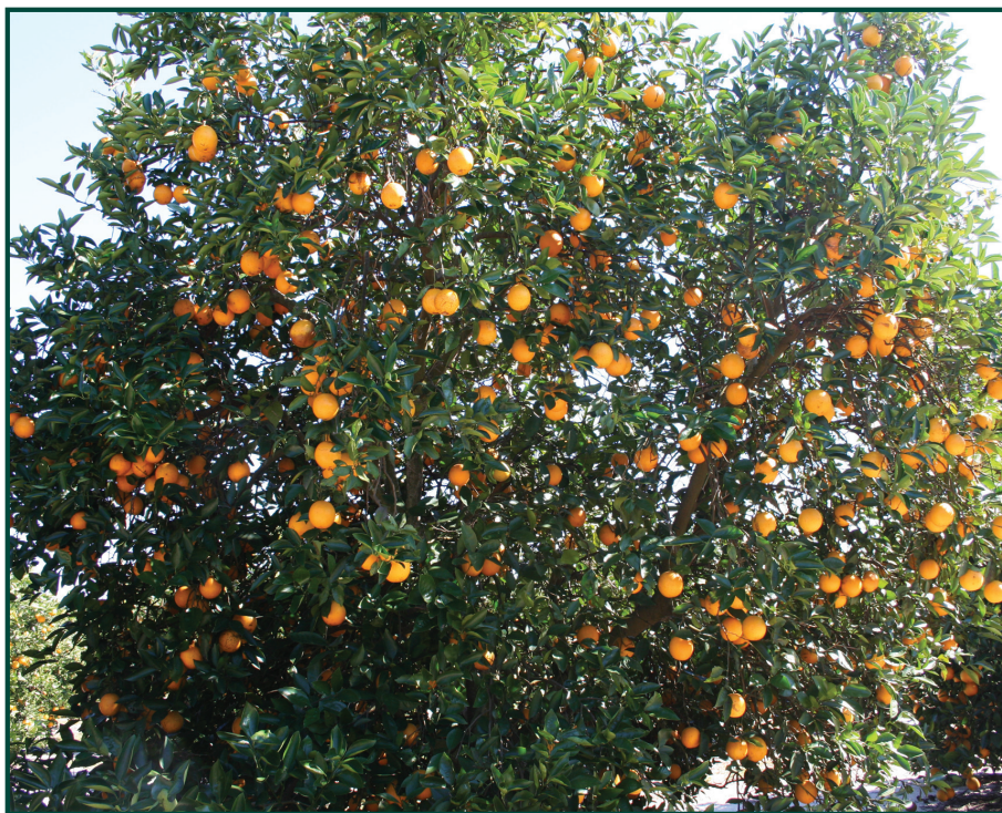
Figure 3. A mature Hamlin orange tree nine months after conversion to pulse fertigation.

A third ACPS experiment was established at the CREC (Citrus Research and Education Center, Lake Alfred) in 2.2 acres of mature 18-year-old Hamlin trees on Swingle citrumelo rootstock