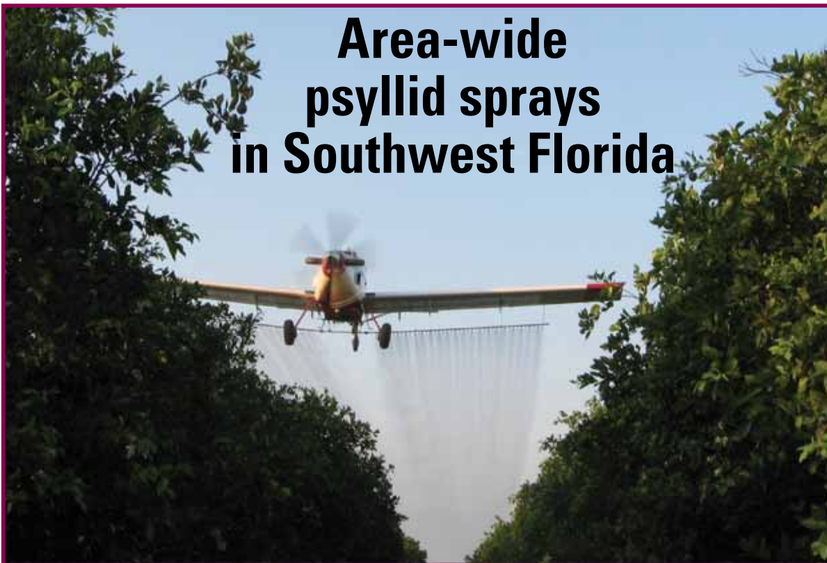
Figure 1. Specially-equipped, fixed-wing aircraft provide a rapid, effective and inexpensive alternative for application of dormant sprays against Asian citrus psyllid in large groves during late fall and early winter.