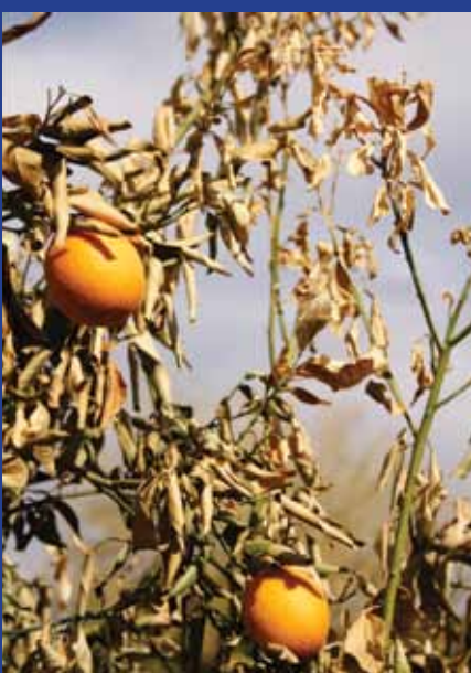
Damage to a valencia orange tree after a freeze

Nutrients uptake during periods when the soil is cold is significantly reduced as compared to warmer season applications. Most growers make their first dry fertilizer application ahead of the new growing season in February or early March. Planning for this important fertilizer application should