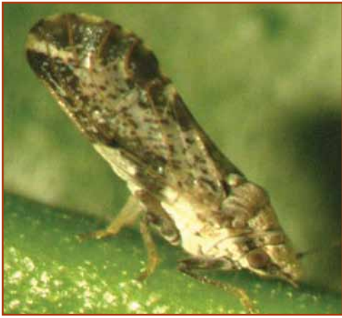
Asian citrus psyllid

become established across the state, but does not provide sufficient natural control of the psyllid populations to slow the spread of HLB.