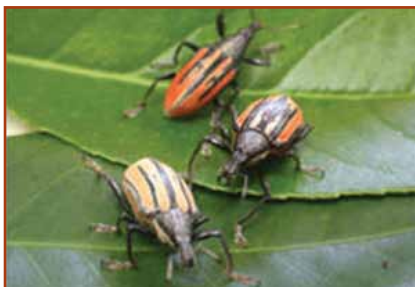
Adult diaprepes weevils

Utilizing rootstocks or varieties that are tolerant or resistant to various insect or disease pests is a common practice in many fruit and vegetable production programs. When considering host resistance in a new citrus planting that may be in production for many years, the selection of a scion variety that can be grown and marketed profitably may be more important than its susceptibility to selected pest issues. Citrus rootstocks are available that are resistant to citrus tristeza virus (CTV) and offer some tolerance or resistance to Phytophthora foot rot and root rot. Resistance to nematodes and the Diaprepes root weevil may also be an important consideration in some areas where these pests are endemic.