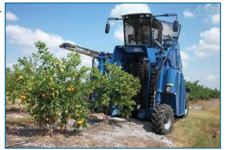
Figure 2 (below). A BEI over-the-row blueberry harvester is being tested for harvesting young citrus trees.

Figure 1 (right). An Oxbo overthe-row olive harvester is being tested for harvesting young citrus trees.