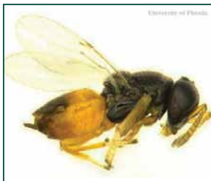
Figure 2. Female Diaphorencyrtus aligarhensis .