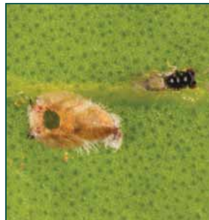
Figure 3. Tamarixia radiata female emerged by chewing a circular exit hole in the integument of the dorsal thorax of mummified nymph.

The female T. radiata lays her egg under a third to fifth instar ACP nymph while D. aligarhensis injects her egg inside the second to fourth instar. Once hatched, the T. radiata larva rapidly consumes the body contents of the nymph, and then fastens the tan shell or mummy to the leaf with silk threads before pupating inside. ACP mummies caused by D. aligarhensis are dark brown and attached to the leaf by a dried secretion from the larva. Adult T. radiata emerge by chewing a circular exit hole in the integument of the dorsal thorax (Figure 3) whereas D. aligarhensis emerges through the dorsal abdomen. Female wasps may also feed on ACP blood after piercing the nymph with the ovipositor. Each T. radiata female is capable of