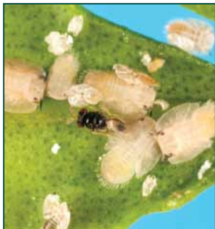
Figure 1. Female Tamarixia radiata laying egg on ACP nymph.

Tamarixia radiata (Figure 1) and Diaphorencyrtus aligarhensis (Figure 2), the two well-known parasitoids of ACP nymphs, were first imported into Florida from Taiwan and southern Vietnam and released in numerous locations from 1999 to 2001. A state-wide evaluation in 2006–2007 showed widespread dispersal and establishment of T. radiata , but D. aligarhensis was not detected. Repeated efforts to establish an all-female colony of D. aligarhensis have not been successful, but we are continuing efforts to establish this species including release of both males and females. Parasitism rates of ACP by T. radiata were generally low in