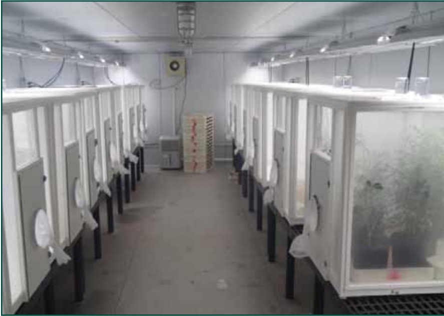
Figure 5. Cages for rearing Tamarixia radiata .

the impact on pest populations. Hot spots may receive consistent, occasional or one-time releases depending on impact and the citrus management practices. Additional collaborative research to evaluate the impact of T. radiata releases on ACP in commercial citrus is being conducted by scientists from UF, DPI and USDA.