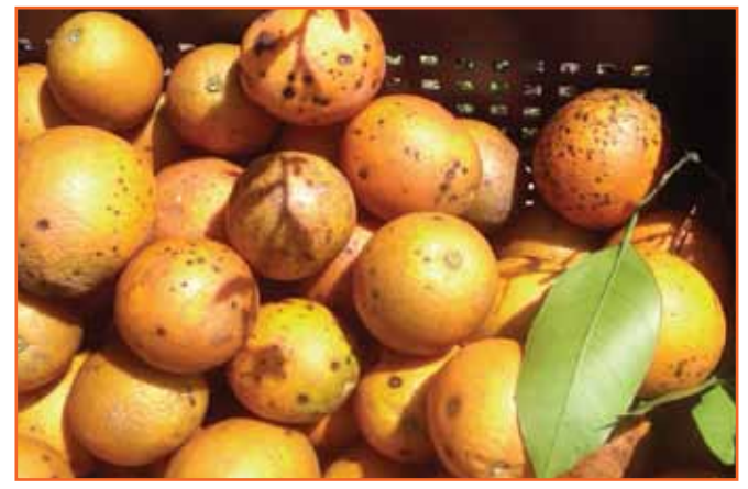
Figure 2. Valencia fruit with citrus black spot collected from under a tree.