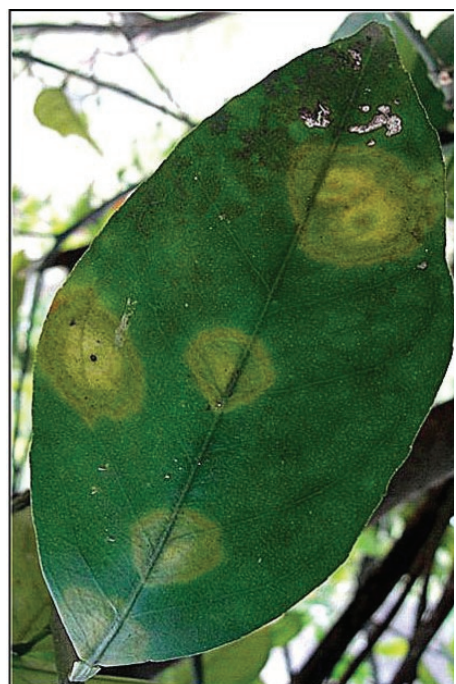
Examples of citrus leprosis.