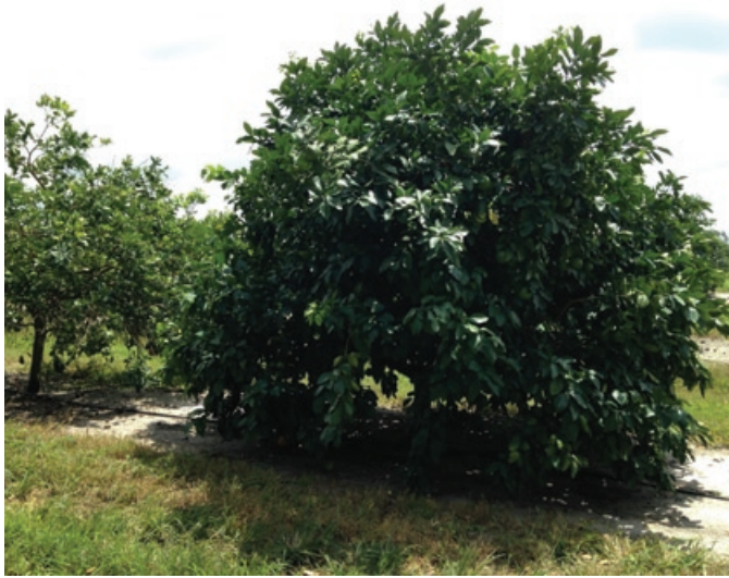
Figure 1. A healthy-appearing, 7-year-old red grapefruit tree (right) on a somatic hybrid rootstock growing at a cooperators site along Highway 60 in Vero Beach. The adjacent tree is also on the same rootstock.