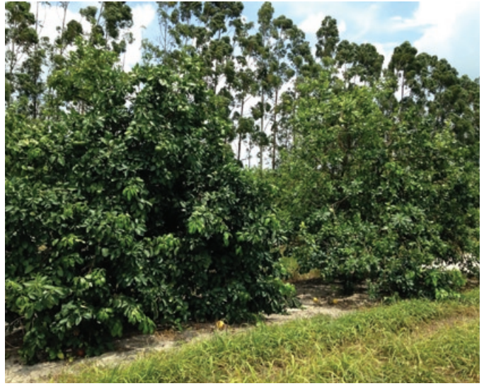
Figure 2. A healthy-appearing Marsh grapefruit tree (left) on a rootstock rated highly by growers attending a field day at Premier Citrus in Vero Beach in October 2014. Both trees in the photo are on the same rootstock.

or a combination of a tolerant scion and rootstock?) can have good crops of normal-looking fruit.