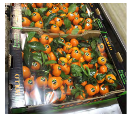
Figure 3. Fruit is packed with stems and leaves remaining to indicate freshness.

All fruit harvested for the fresh market is individually clipped from the stem, leaving a small portion of the stem still attached to the fruit. Clipping contributes to improved fruit shelf life by eliminating some fruit decay diseases. For some markets, fruit is harvested with a short stem and a few leaves attached (Figure 3) to it. A telltale sign of freshness for consumers is the leaves remaining fully attached and spread open.