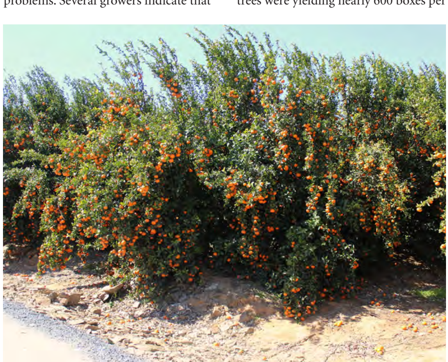
Figure 2. This block averages more than 600 boxes per acre.

Yields per acre vary widely with variety, tree age, tree density and location. We saw many groves in which trees were yielding nearly 600 boxes per