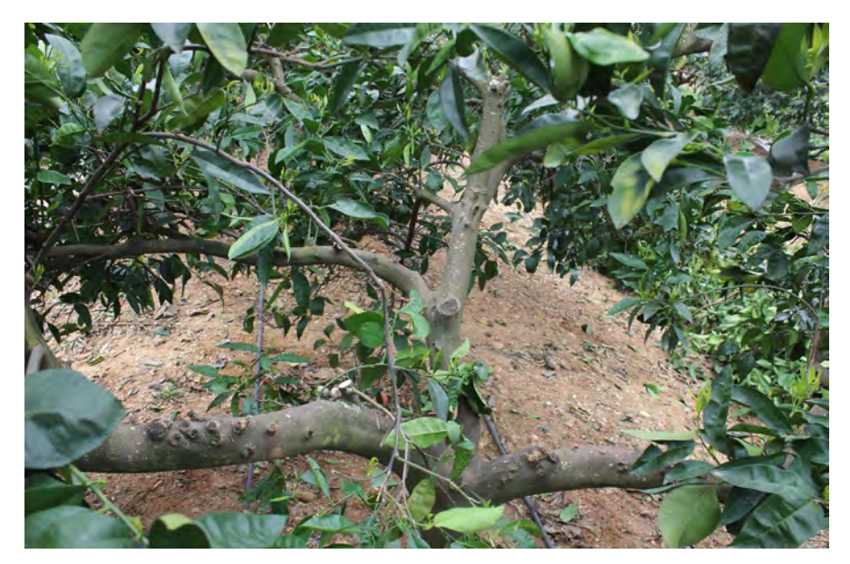
Figure 4. Open pruning in the center of the tree allows more light to penetrate the internal canopy.

We noticed groves that were only 10 to 15 years old that had already