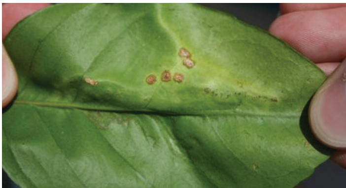
Figure 3. Young, blister-like lesions of citrus canker

The early leaf symptoms appear as slightly raised, tiny, blister-like lesions (Fig. 3). When leaf lesions are young, the yellow halo is most prominent (Fig. 4). As the lesions age, they turn tan to brown, and a water-soaked margin appears surrounded by a yellow ring or halo. The center of the lesion becomes raised and corky. The lesions are usually visible on both sides of the leaf (Fig. 5).