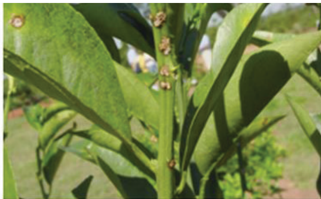
Figure 6a. Young lesions of citrus canker on young twigs

and consist of dark brown or black raised corky lesions surrounded by oily or water-soaked margins (Fig. 6b). As the lesions mature, they appear scabby or corky