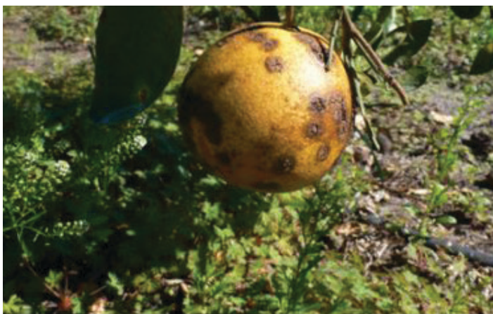
Figure 8. Old lesions of citrus canker on grapefruit