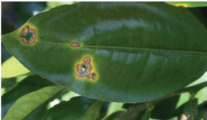
Figure 5. Old lesions of citrus canker displaying the "shot hole effect"

Stem and Twig Lesions. Stem lesions often indicate infection has been present for at least a year. They serve as a reservoir for persistent inoculum and are able to produce inoculum for up to four years. When they occur on woody tissue, they are the same color as the branch but have a raised, wart-like surface (Fig. 6a). Symptoms on twigs and fruit are similar