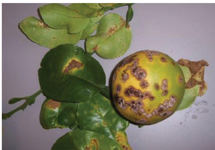
Figure 1. Necrotic canker lesions on grapefruit stems, leaves, and fruit

Citrus canker, caused by the bacterial pathogen Xanthomonas citri subsp. citri , is a serious disease of citrus. Most citrus cultivars are susceptible; grapefruit, Mexican lime, and some early oranges are the most susceptible. 'Navel', 'Pineapple', and 'Hamlin' oranges are moderately susceptible. Mid-season oranges, 'Valencia' oranges, tangors, tangelos, and other tangerine hybrids are less susceptible, and tangerines are tolerant. The disease causes necrotic dieback, general tree decline, premature fruit drop, and fruit blemishes. Severely infected trees become weak, unproductive, and unprofitable.