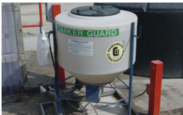
Figure 11c. Large tank used for storage of decontaminant for automatic systems