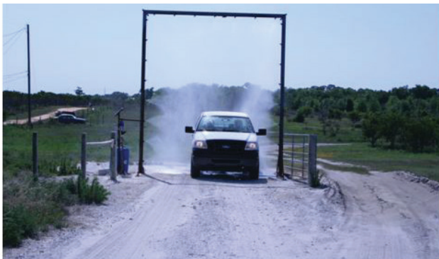
Figure 11b. Automatic vehicle and equipment decontamination station

for equipment on your skin as it is harsher than the personal solution. Equipment decontamination solutions should be checked monthly for quaternary ammonium chloride (QAC) concentration to ensure effectiveness.