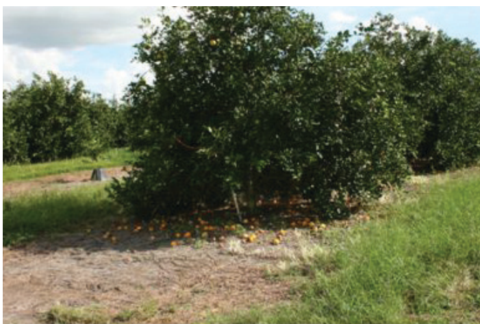
Figure 9. Fruit drop caused by a severe canker outbreak