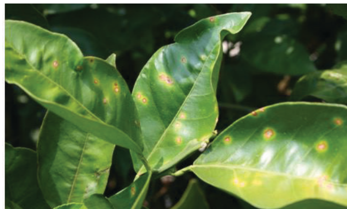
Figure 4. Young lesions of citrus canker with yellow halo