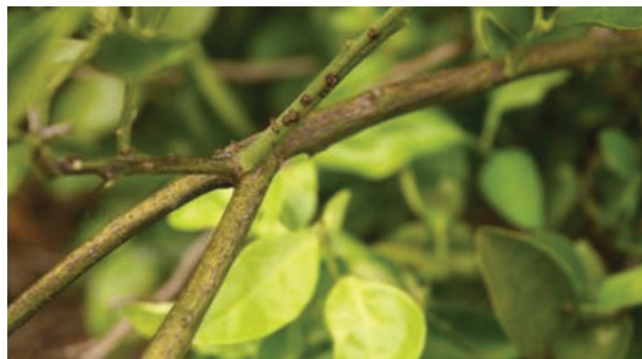
Figure 6b. Young lesions of citrus canker on young twigs

Fruit Lesions. Young lesions are raised, blister-like, tan, and can be surrounded by yellow halos, depending on fruit maturity (Fig. 7). As lesions age, they become dark brown to black with brown to black sunken, corky centers, and they may have yellow halos (Fig. 8). Old lesions often have a gray appearance. Generally, the lesions are circular and vary in size. Lesions cause blemishes and early fruit drop, thereby reducing fruit yield (Fig. 9). The internal quality of the fruit is not affected.