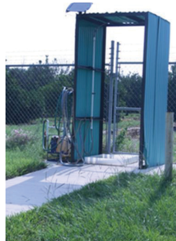
Figure 11a. Automatic personnel decontamination station

To decontaminate vehicles and equipment, a one-gallon garden sprayer is simple and lightweight for storage and transport. When applying, begin spraying at the top of the vehicle and/or equipment and move downward until the spray material is running off. Other areas to spray include, but are not limited to, the tops of tool boxes, tires, and wheel wells. Unless it is designated as a two-in-one solution, the decontamination solutions are intended for either personnel or equipment. Do not use the solution designated