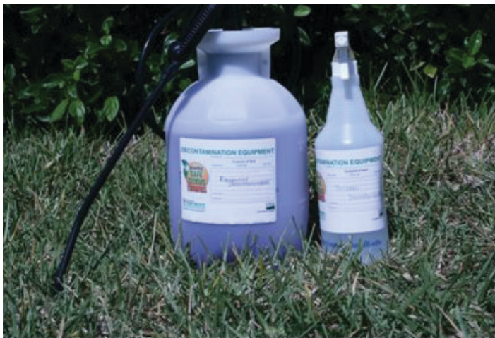
Figure 12. Types of spray bottles

Decontamination training is required annually for grove workers and harvesters. Trainings can be scheduled through local UF/IFAS Extension offices. Personnel are required to decontaminate upon exiting a grove. The exception to this rule applies to harvesters. Harvesters are required to decontaminate upon entering and exiting