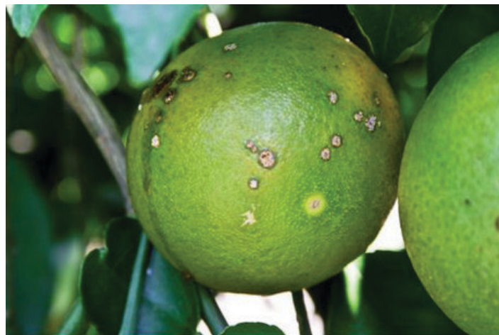
Figure 7. Young, blister-like canker lesions on fruit

Fruit Lesions. Young lesions are raised, blister-like, tan, and can be surrounded by yellow halos, depending on fruit maturity (Fig. 7). As lesions age, they become dark brown to black with brown to black sunken, corky centers, and they may have yellow halos (Fig. 8). Old lesions often have a gray appearance. Generally, the lesions are circular and vary in size. Lesions cause blemishes and early fruit drop, thereby reducing fruit yield (Fig. 9). The internal quality of the fruit is not affected.