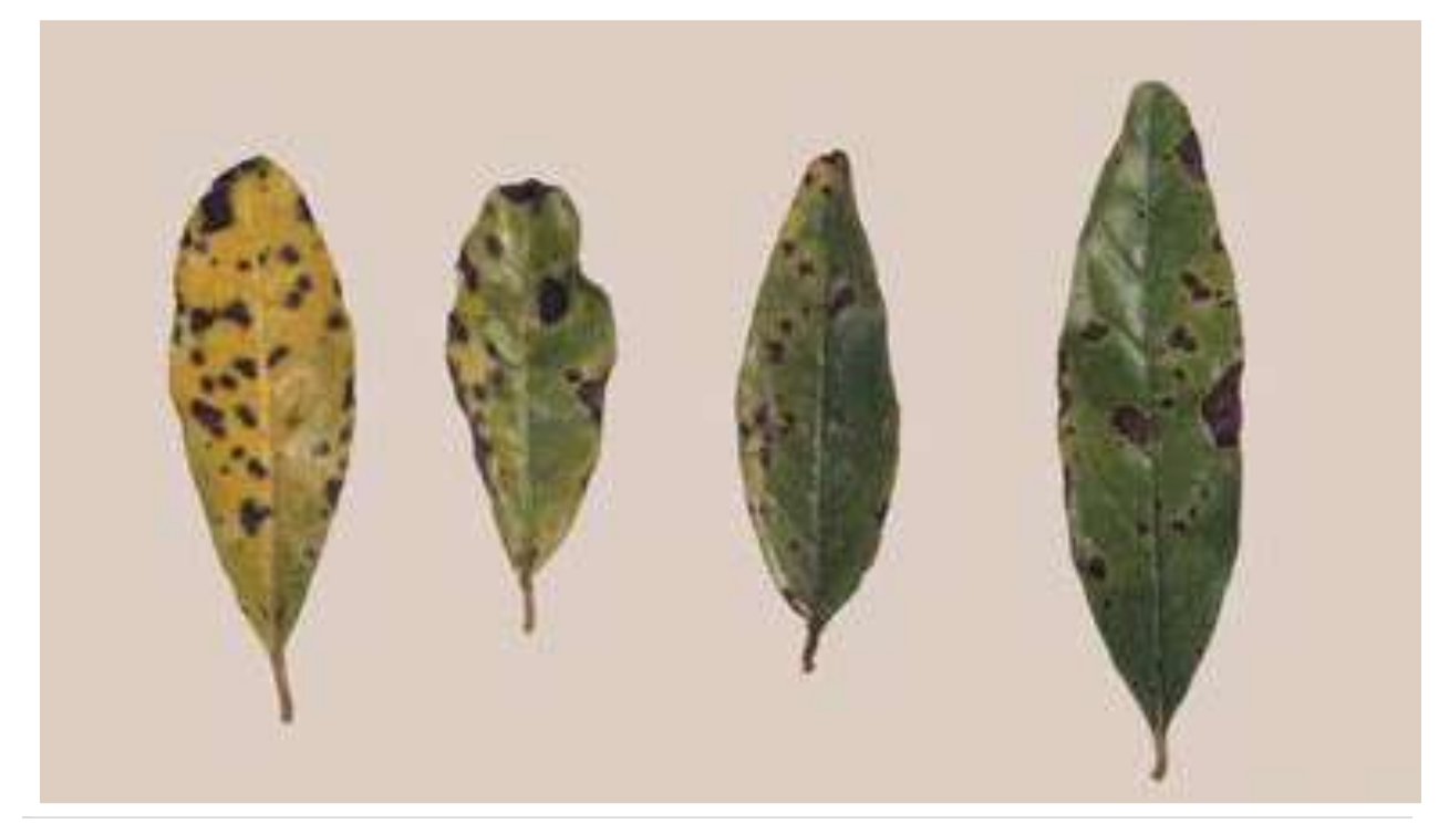
Bill Castle, UF/IFAS/Citrus Research and Education Center, Lake Alfred

A. So far, it appears that fungal problems may be the most serious limiting factor. The brown leaf spots shown in the figure below are caused by Cercospora punicae . We have already seen this fungus on leaves of trial plants. The fungus causes leaf drop, but is probably easily controlled with copper sprays. The fungus is an Ascomycete like Mycosphaerella citri , the organism that causes greasy spot.