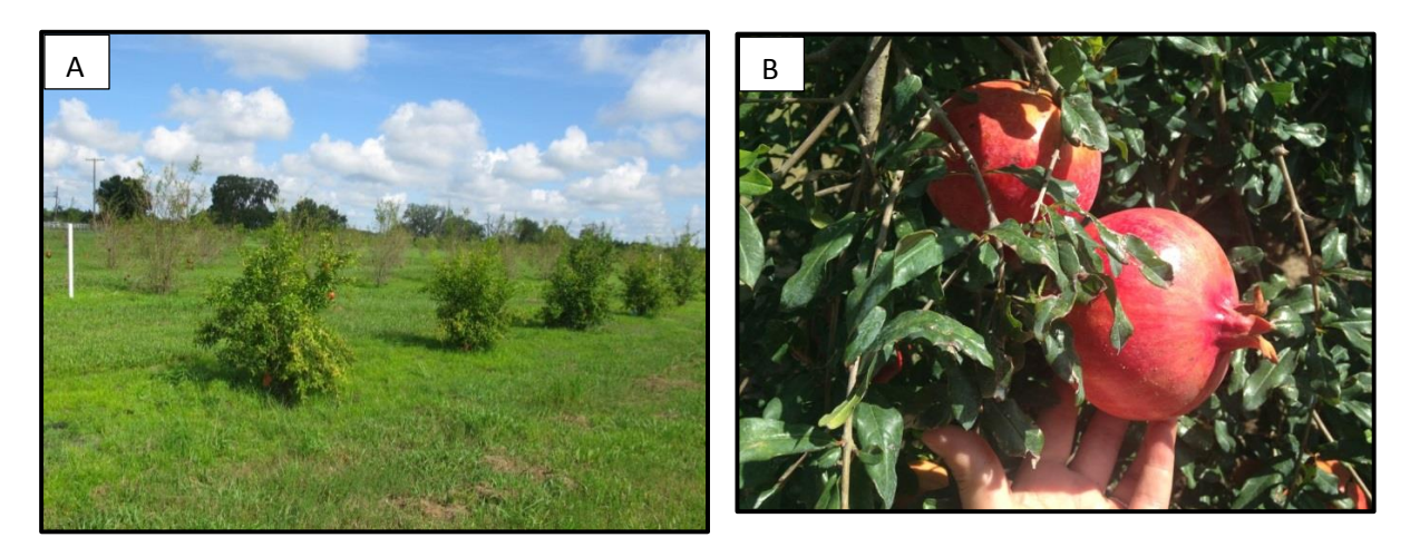
Figure 3: Fungicide field trial: A) the treated trees in front row vs untreated trees in back rows B) fungicide treated fruits at the end of growing season

Five fungicides Cabrio, Penncozeb, Scala, Switch, and Luna Experience were also tested for their effectiveness under field conditions at several grower sites. Three fungicides, Cabrio, Luna Experience, and Penncozeb were effective against foliar and fruit diseases under field conditions when applied every 2 to 3 weeks. Although promising, additional research is necessary to further the timing and frequency of fungicide applications, as well as identifying favorable fungicide rotations. None of the tested fungicides are currently registered for use on pomegranate. However, testing to establish residue tolerances for several fungicides are planned for 2016.