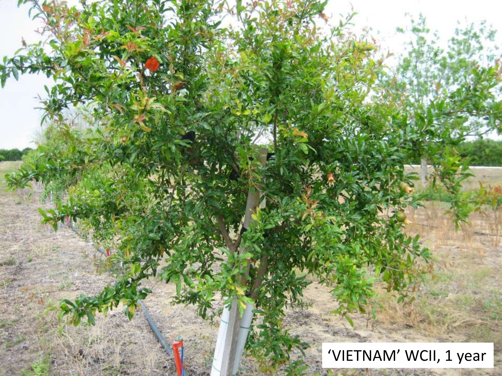
'VIETNAM' WCII, 1 year