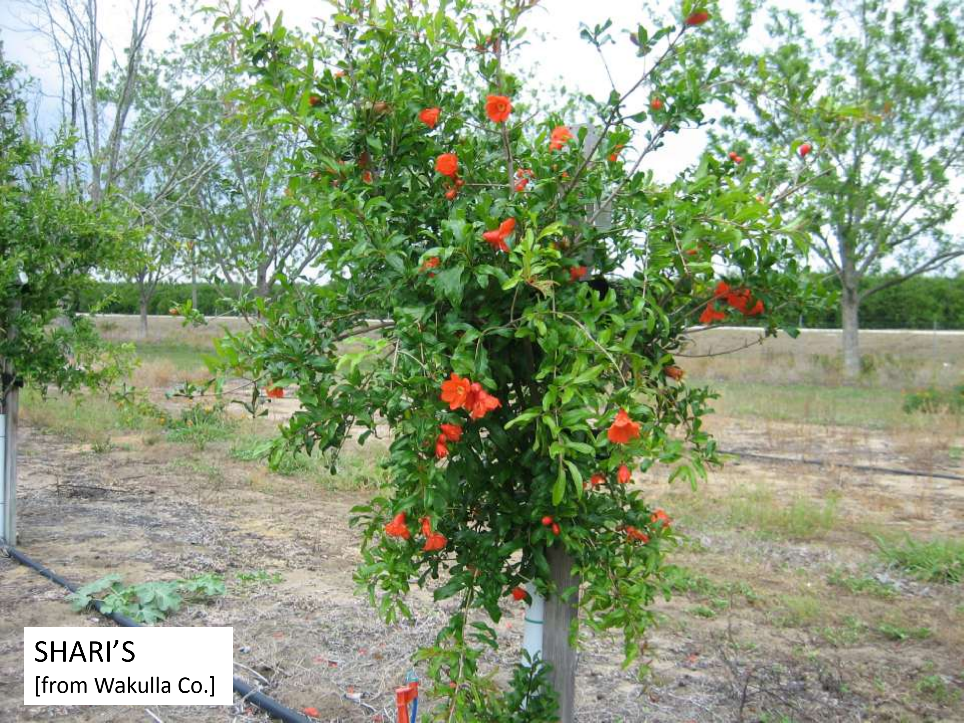
SHARI'S [from Wakulla Co.]