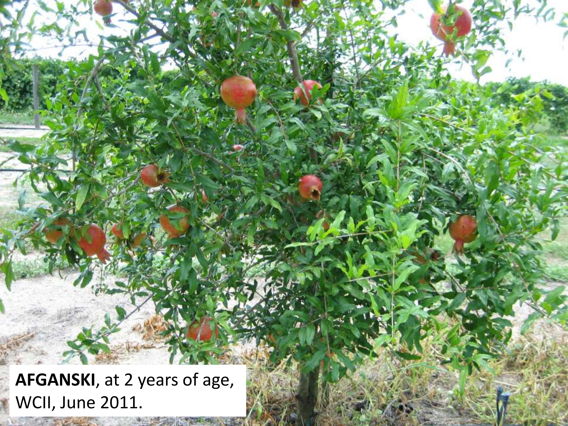
AFGANSKI , at 2 years of age, WCII, June 2011.