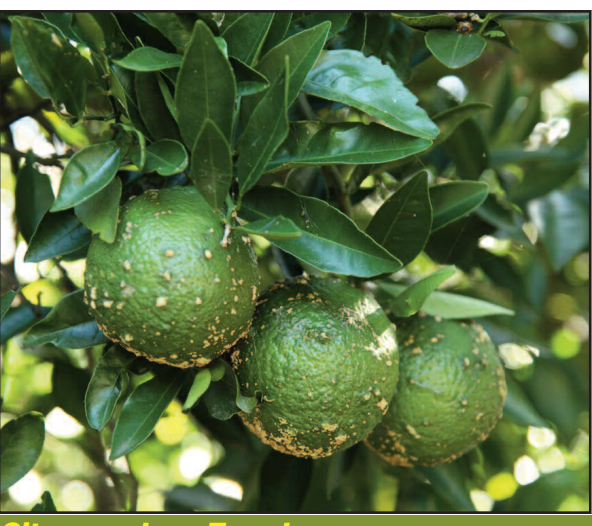
Citrus scab on Temples

Citrus scab is a concern for fresh market citrus only because it is unsightly. The scab affects Temples,