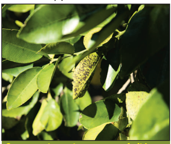
Greasy spot symptoms on grapefruit leaves

ebruary is the time to start thinking about fungal disease control for the upcoming season. Protecting the spring flush to sustain high yields is important. Fungal foliar diseases are most important for those producing fresh market citrus because of fruit blemishes, but some diseases like greasy spot are a concern for all growers. These days when Huanglongbing (HLB) is everyone's major concern, fungal foliar diseases can seem like a minor problem. But it must be remembered that fungal foliar diseases can weaken a tree through defoliation and cause fruit drop, further lowering yields. Defoliation can lead to an increase in the number of flushes over the summer when it has become important to manage the trees for a reduced number of flushes to make them less attractive to psyllids.