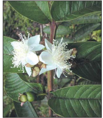
Immature fruit and leaves of guava.