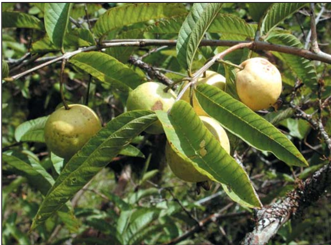
Guavas and newly set fruit of guava.

Recently there has been considerable publicity about the use of guava ( Psidium guajava L. ) trees to fight Huanglongbing (HLB, citrus greening) in Florida, but IFAS recommends caution regarding this proposal. The information that has stirred this discussion comes from observations reported from some Vietnamese citrus growers who for the past 15 to 20